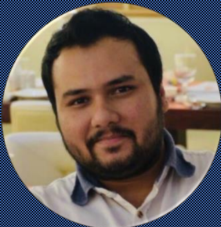
Director of IT Services

A technology leader with outstanding knowledge, technical expertise, and a proven track record of leading complex infrastructure projects and managing help desk teams.