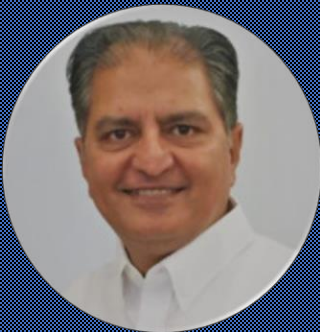
Founder & CEO