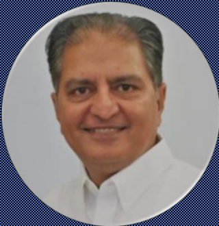
Founder & CEO