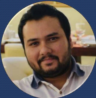
Director of IT Services

A technology leader with outstanding knowledge, technical expertise, and a proven track record of leading complex infrastructure projects and managing help desk teams.